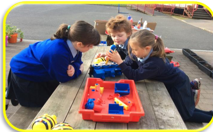
P3 & 4 Trip