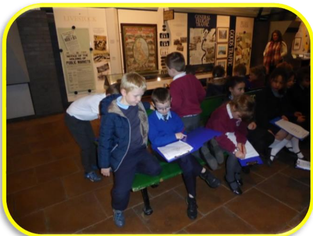
P3 & 4 Parents' Participatory Session